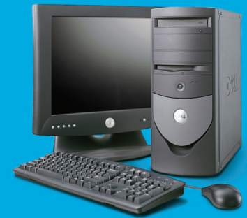
All OneRIP Systems use powerful Dell Workstations